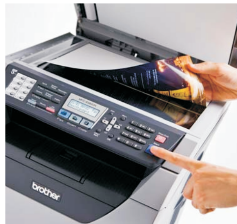
Scan your A4 colour documents.