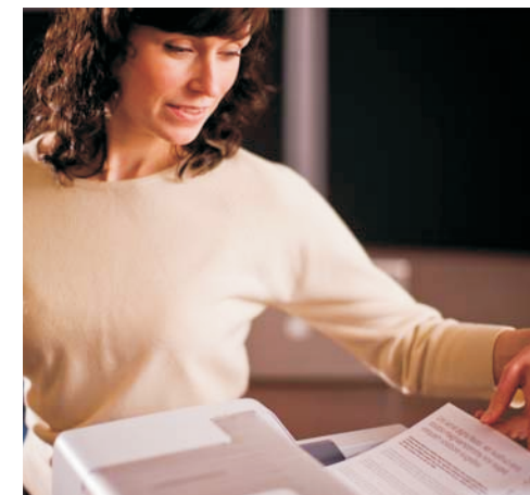
Create an instant impact - with quick 30ppm A4 printing.